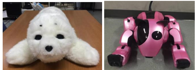
Figure 1. The Robots Used in the Experiment

http://dx.doi.org/10.1145/3029798.3038405